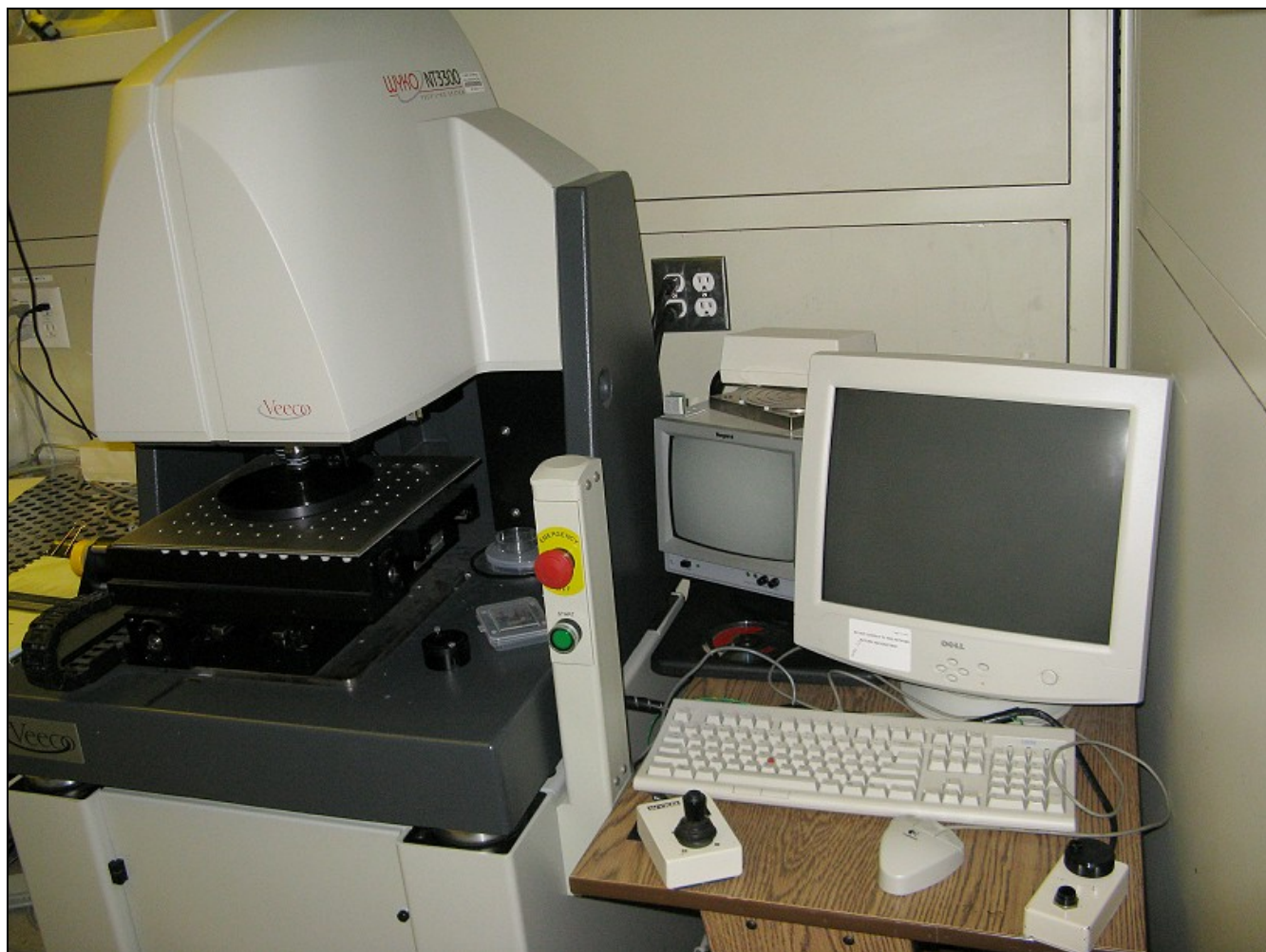
Figure 1 - Wyko NT3300 Profiling System

Wyko NT3300 Profiling System (White-light interferometer)